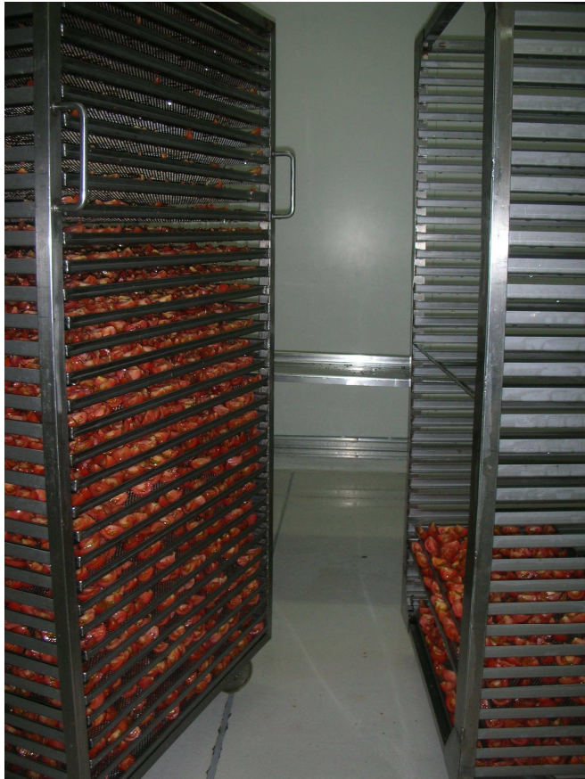
Figure 3. Tomatoes on racks before drying