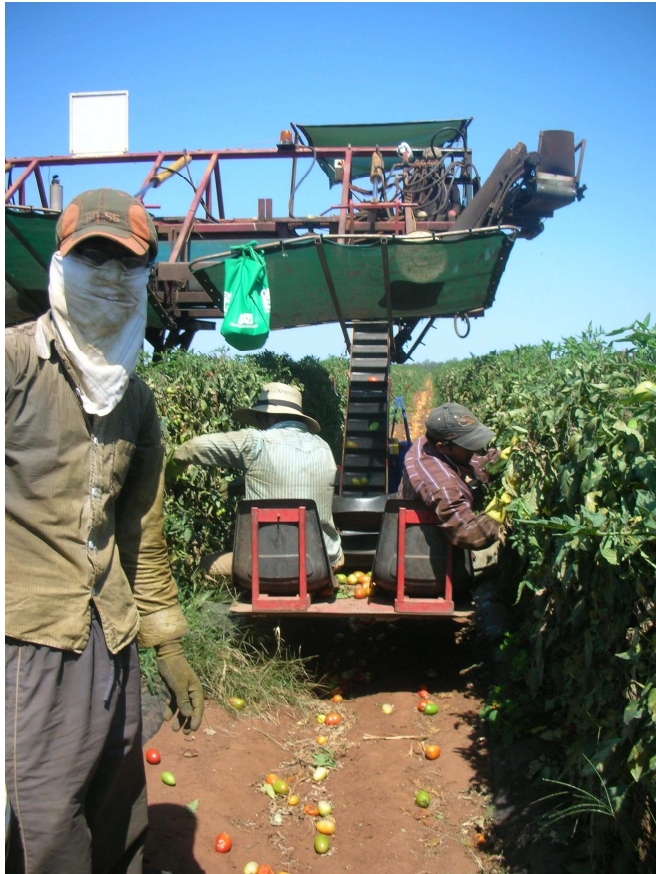
Figure 2. Harvesting tomatoes